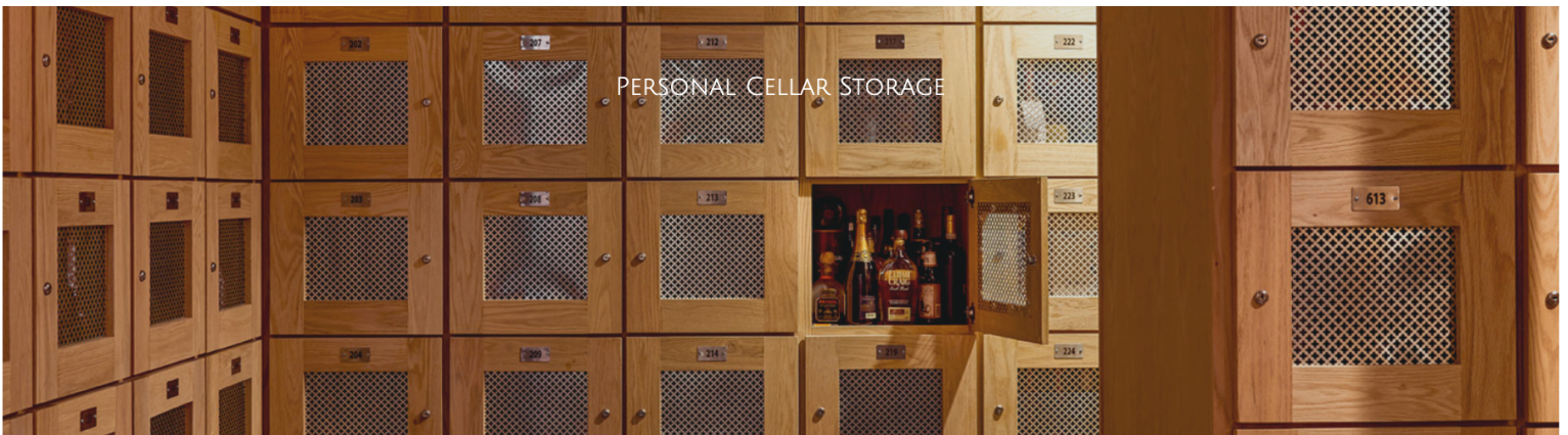
PERSONAL CELLAR STORAGE

All you truly need is the space to do what you want, how you want it.