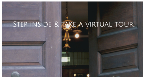
STEP INSIDE & TAKE A VIRTUAL TOUR

“ I love being a part of this BYOB community of wine and spirits lovers.”