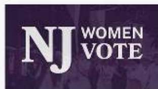
NJ Women Vote